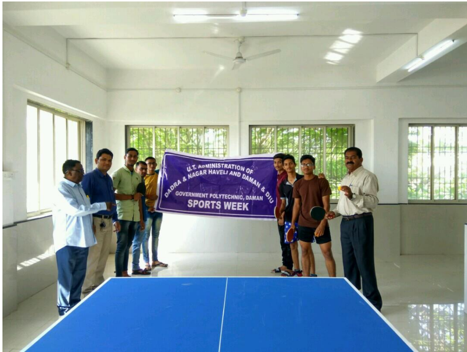
Sports Week 2020