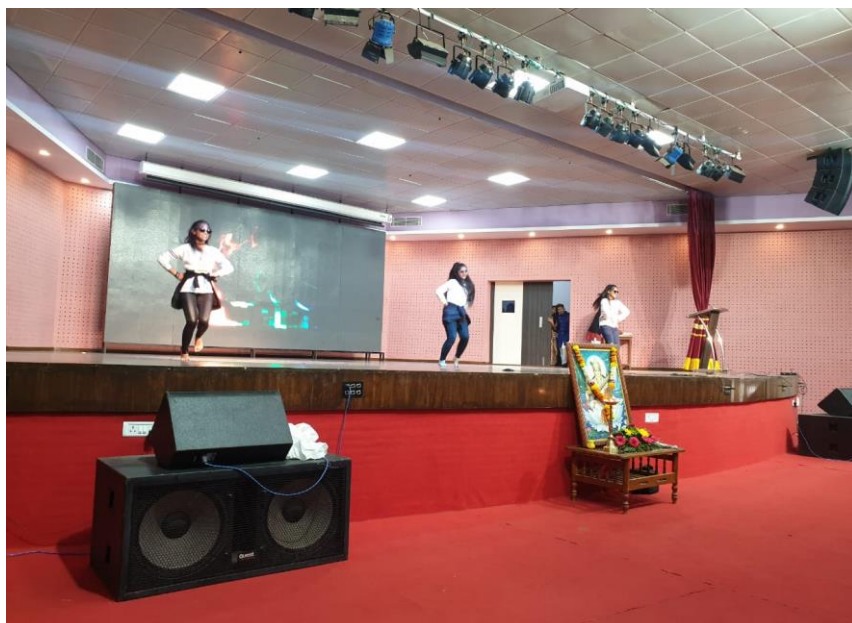
Group Dance (Annual Function)