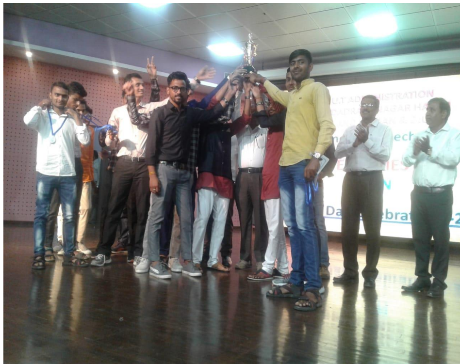
Winner Team Trophy